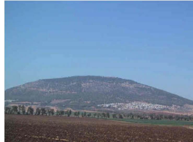
Mt.Tabor Place of the Battle

A prophetess, "wife" (woman?) of Lapidoth. Jabin, the king of Hazor, had for twenty years held Israel in degrading subjection. The spirit of patriotism seemed crushed out of the nation. In this emergency Deborah roused the people from their lethargy. Her fame spread far and wide. She became a "mother in Israel" (Judg. 4:6, 14; 5:7), and "the children of Israel came up to her for judgment" as she sat in her tent under the palm tree "between Ramah and Bethel." Preparations were everywhere made by her direction for the great effort to throw off the yoke of bondage. She summoned Barak from Kadesh to take the command of 10,000 men of Zebulun and Naphtali, and lead them to Mount Tabor on the plain of Esdraelon at its north-east end. With his aid she organized this army. She gave the signal for attack, and the Hebrew host rushed down impetuously upon the army of Jabin, which was commanded by Sisera, and gained a great and decisive victory. The Canaanitish army almost wholly perished. That was a great and ever-memorable day in Israel. In Judg. 5 is given the grand triumphal ode, the "song of Deborah," which she wrote in grateful commemoration of that great deliverance.